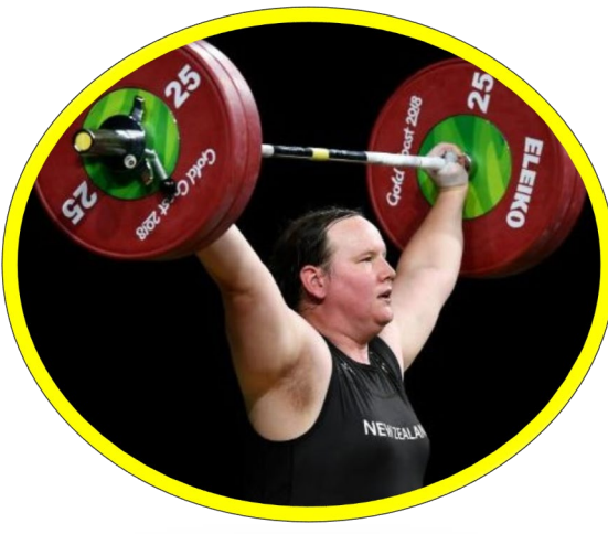
Laurel Hubbard -New Zealand